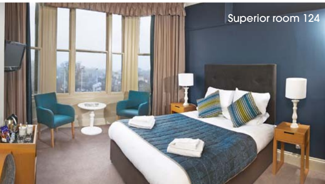
Superior room 124